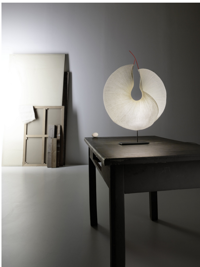
Yoruba Rose DAGMAR MOMBACH, INGO MAURER & TEAM 2017

Paper, metal, stainless steel, silicone. Yoruba Rose is a light object that enchants through perfection and grace. The sheet of paper is almost circularly stretched on light metal wires and strives upwards. The harmonious expression of the model and the extremely pleasant light make it the ideal light source in spaces where one rests. Yoruba Rose can also be produced as a standard lamp on request. Just as in all other MaMo Nouchies, the lampshade consists of Japanese paper, which has to undergo a special manufacturing process in Dagmar Mombach's studio. The light source is an LED module, provided with a cooling element, developed by Ingo Maurer especially for the MaMa Nouchies. The light is warm and soft, and can hardly be distinguished from conventional halogen light. Yoruba Rose is usually available for immediate delivery.